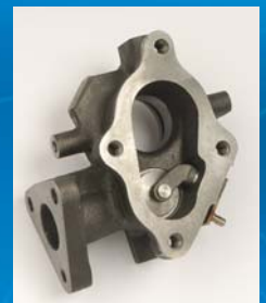
MELETT & TURBO FACTORY JOIN FORCES