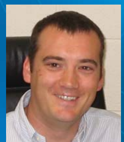
MEET THE TEAM Melett Grows with the