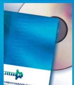
MELETT CATALOGUE CD Version 2.0