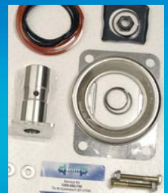
KEEPING THE OLD TURBOS ALIVE